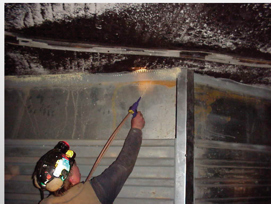
SEAL METAL STOPPINGS