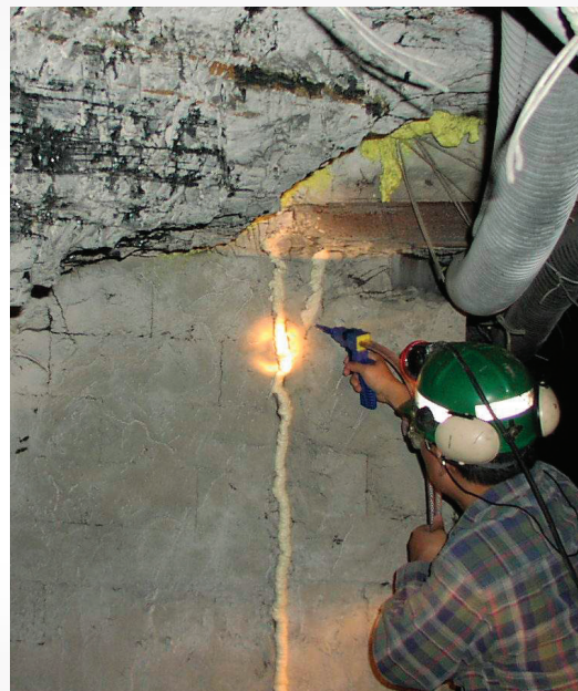
REPAIR DAMAGED BLOCK STOPPINGS